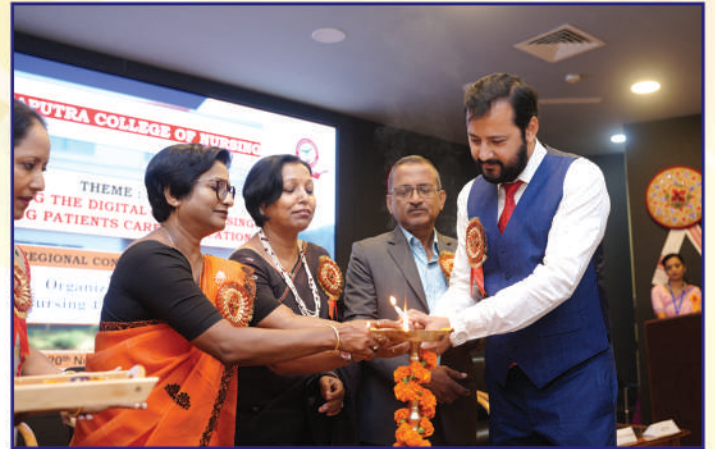
1 st Regional Conference of BSc. Nursing 2021 Batch