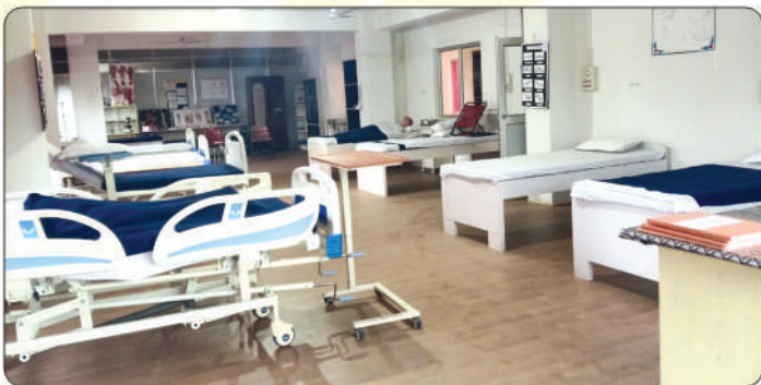
Nursing Foundation Lab-1