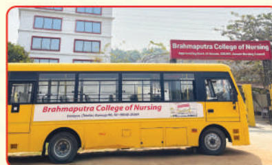
Bus Facility Available