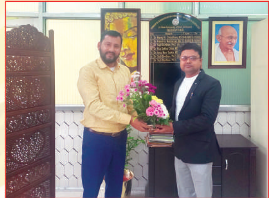
Director of Brahmaputra College felicitating the Registrar of SSUHS