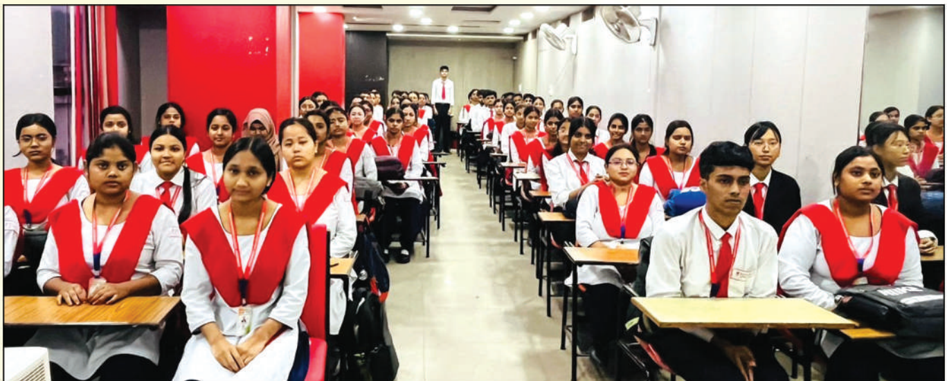
BSc. Nursing 2025-26 Batch

Course Fee are available in the college office & website