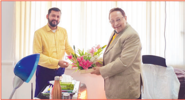
Director of Brahmaputra College felicitating the Hon'ble Ex. Vice-Chancellor of SSUHS