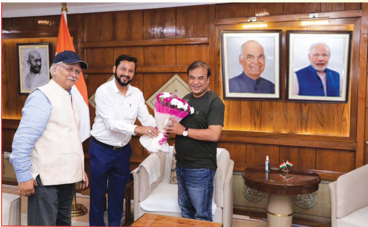
Director of Brahmaputra College felicitating the Hon'ble Chief Minister of Assam

Ministry of Human Resource Development, Govt. of India