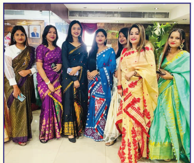
Sri Sri Swaraswati Puja Celebration in College Premises