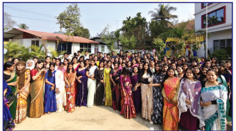
Lamp Lighting & Swaraswati Puja Celebration for BSc. Nursing Students