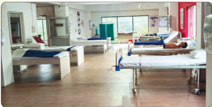
Nursing Foundation Lab-2