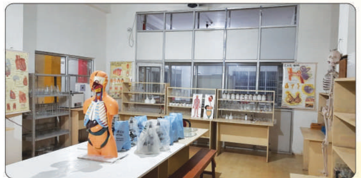
Anatomy & Physiology Lab