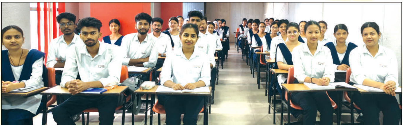
BSc. Nursing 2024-25 Batch

Eligibility : BSc. (Nursing) with min. 50% for General 45 % for ST/SC/OBC and to be qualified in CEE of SSUHS