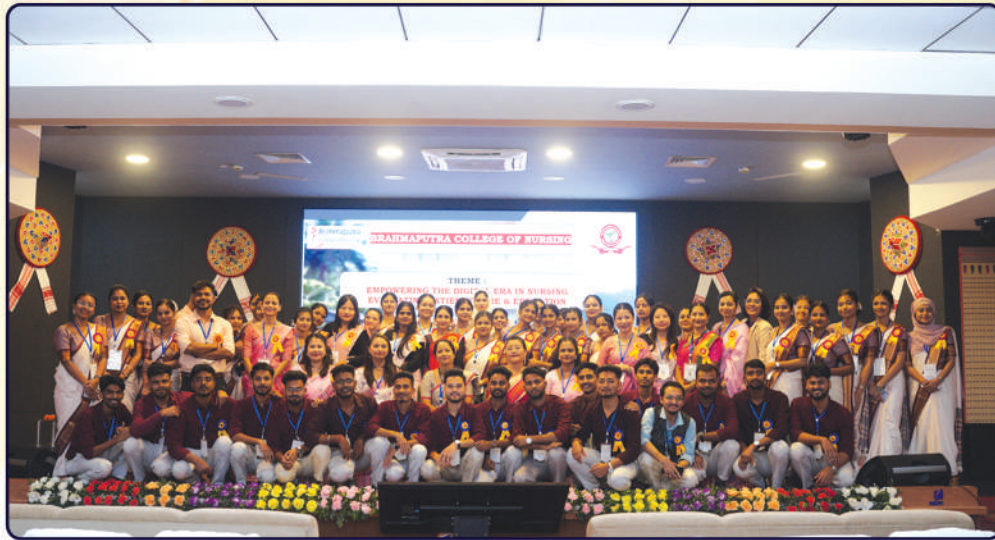
1 st Regional Conference for BSc. Nursing 2021 Batch