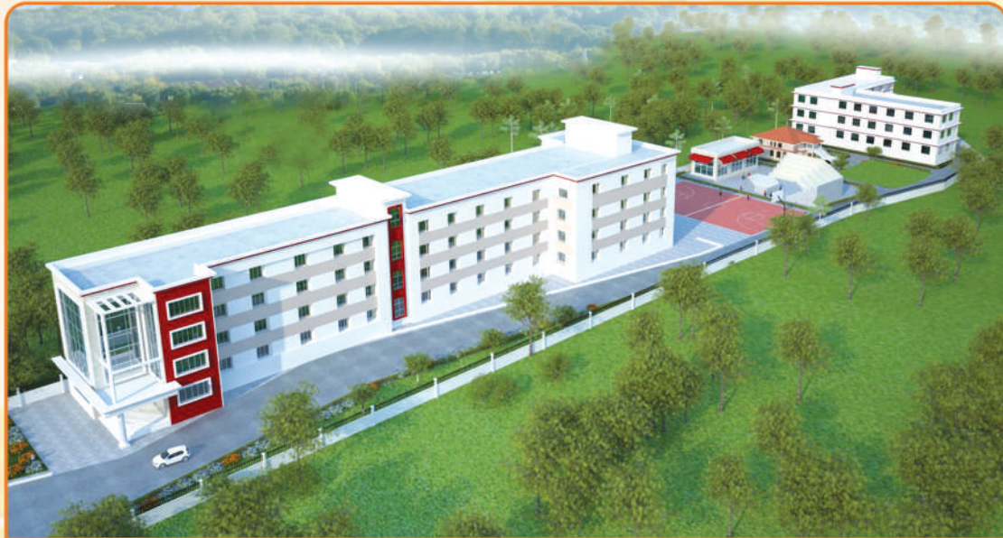
Proposed view of Main Campus, Sonapur, Kamrup (M), Assam